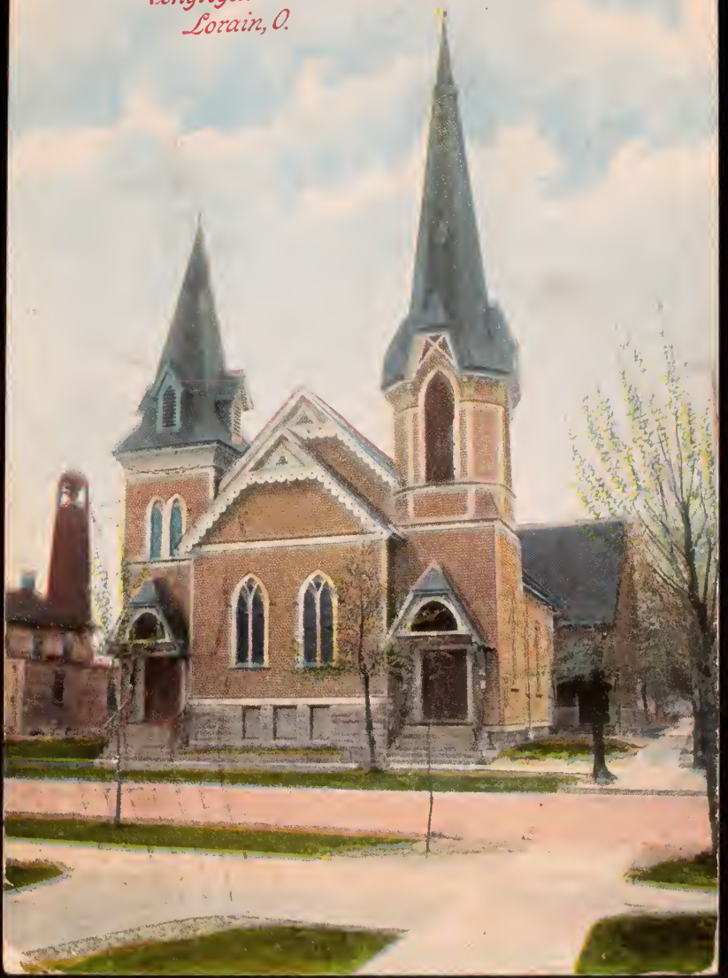
Congregational Church, Lorain, O.